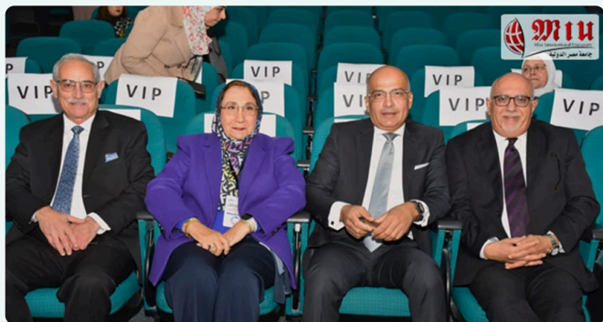
Faculty of Oral and Dental Medicine