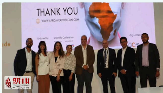
Faculty of Oral and Dental Medicine